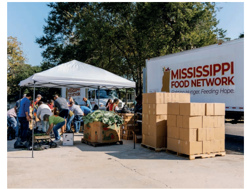
A mobile pantry at First Baptist in Raymond, Mississippi provided food to 300 families.