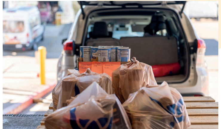
We received a generous Instacart donation from a kind supporter.