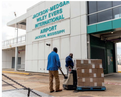
We provided emergency food boxes to federal staff at Jackson-Medgar Wiley Evers International Airport.