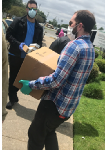
pictured left and above are volunteers helping at one of the many drivethrough food giveaway; pictured below are families lined up to receive their food package; lines such as these grew longer and longer as the pandemic stretched on.

Here at MFN, we met this onslaught head on. We were fortunate that our doors remained open (we only closed a couple of times for disinfection), and we were able to continue to provide aid to the growing numbers of families in need of food assistance. All of our staff members, volunteers, donors, and those partner agencies that could remain open helped to make this happen.