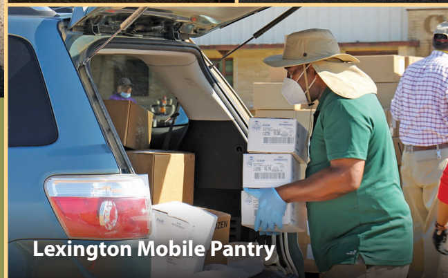
Lexington Mobile Pantry

Thank you for helping us help those who have never had to ask for help.