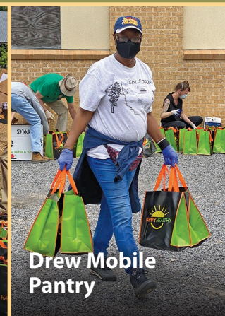
Drew Mobile Pantry