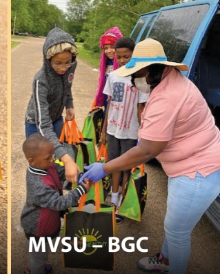
MVSU – BGC

Leaders at the Boys & Girls Club at Mississippi Valley State University helped distribute the child meal/snack kits to their children, even they are closed at this time.